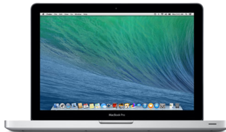
13" MacBook Pro non Retina Display