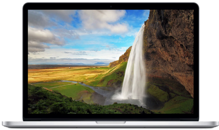
13" MacBook Pro with Retina Display