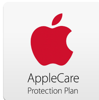
3 Year Support Phone / Parts / Labour