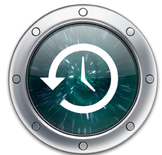
1TB (minimum) Portable Backup Drive