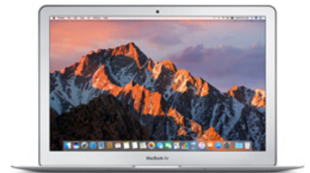
13" MacBook Air