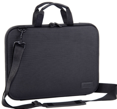
Hard-Sided Shoulder Bag